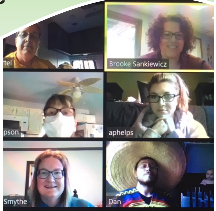
The Assertive Community Treatment (ACT) team works to gain their clients independence, community inclusion, a strong support network and more.

“Having that team of people all working together to best support those served is