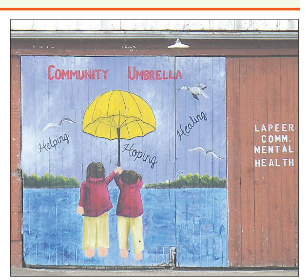
This art mural is a reminder that CMH is Lapeer See Community page 4 COMMUNITY Mental Health.