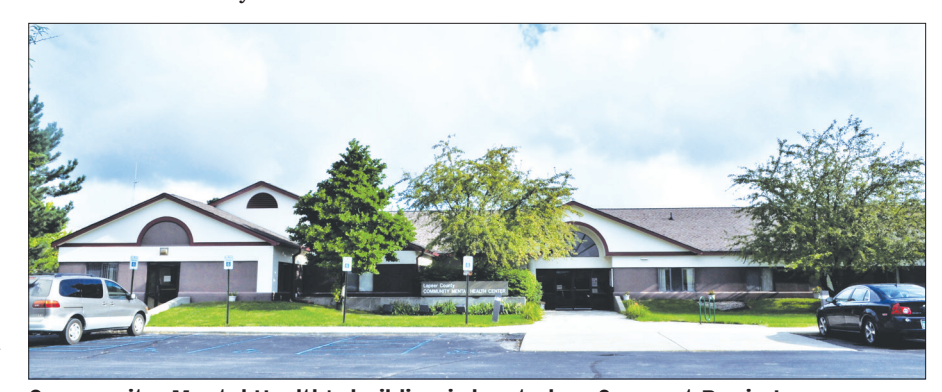
Community Mental Health's building is located on Suncrest Dr., in Lapeer across from Suncrest Medical Care Facility.